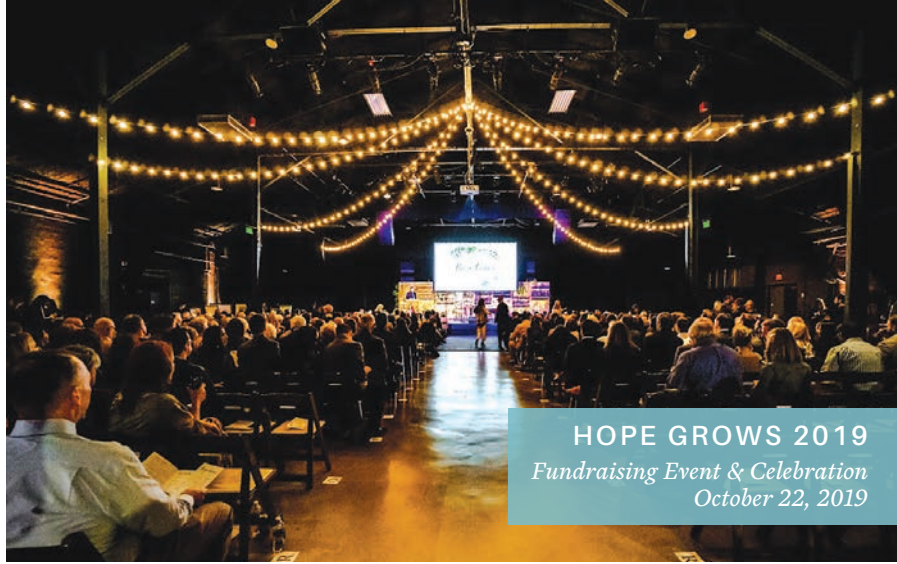
HOPE GROWS 2019 Fundraising Event & Celebration October 22, 2019

103 FORREST CROSSING BLVD. SUITE 102 FRANKLIN, TN 37064