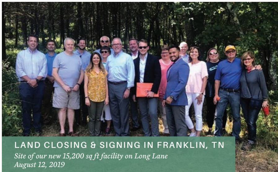
LAND CLOSING & SIGNING IN FRANKLIN, TN Site of our new 15,200 sq ft facility on Long Lane August 12, 2019